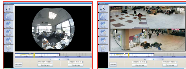
Screen shots of Haloviewer

The Haloviewer SDK enables developers to integrate this powerful investigative tool into their own Windows applications running on DVRs and PCs.